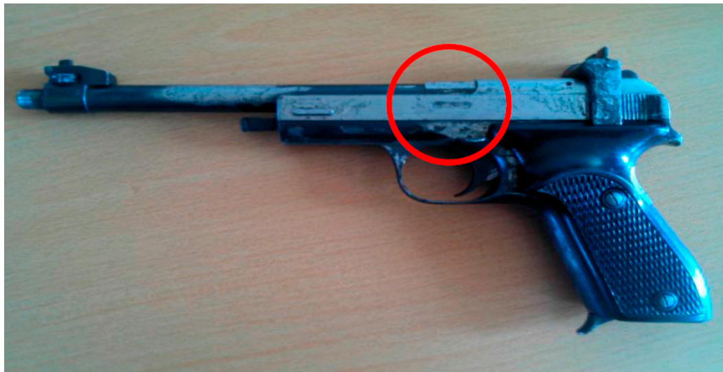
Object photo — the Mosin rifle with corroded marking