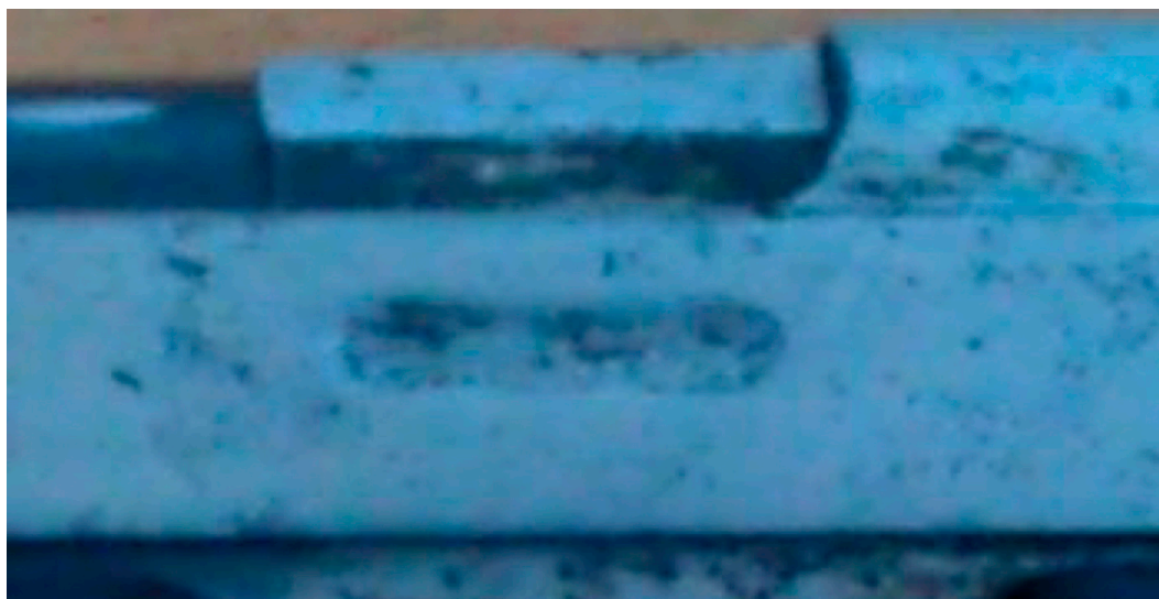
Object photo — the MCM pistol with the removed number