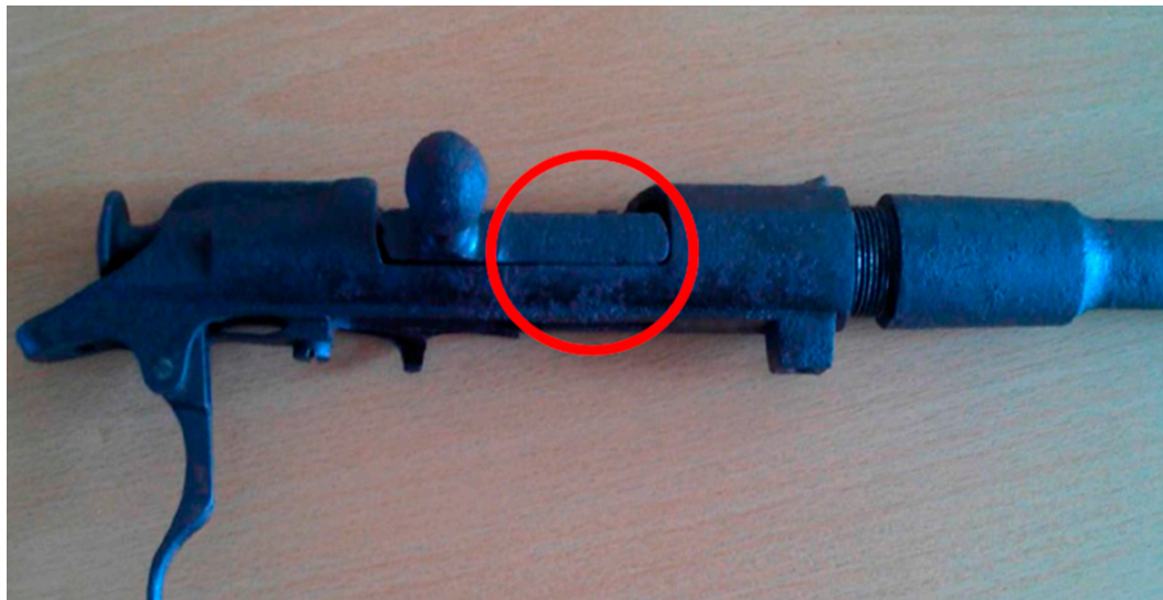
Object photo — the Mosin rifle with corroded marking