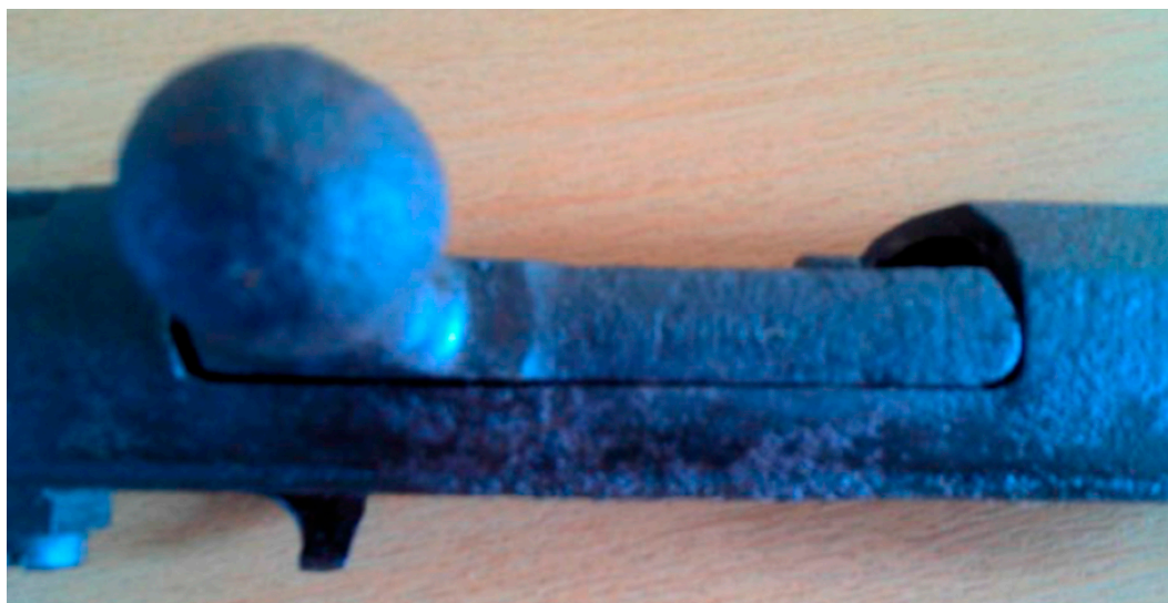
Photo of the number platform — elements of the number are not recognized